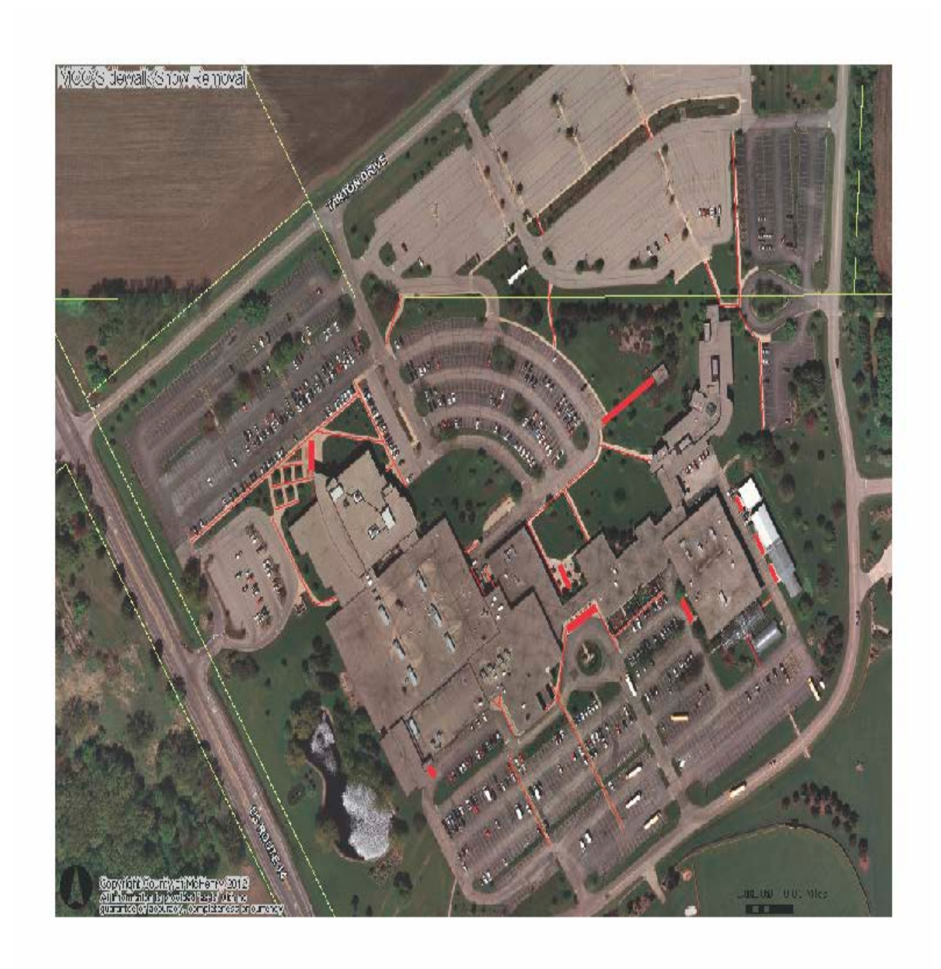
Main Campus - Sidewalks and Entrances